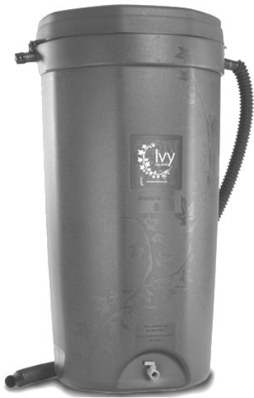
Rain Water Solutions $70

The 50-gallon Ivy rain barrel provides a new era of design innovation for an economical price. Available in forest green. All components included to start collecting and using your rainwater!