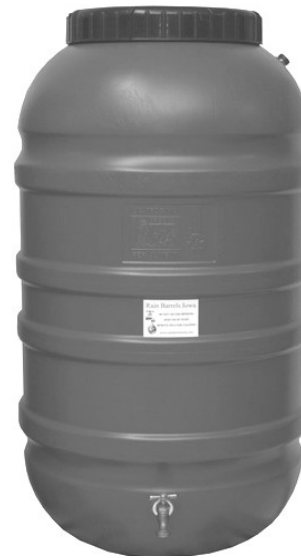
Rain Barrels Iowa $120 (S), $165 (D)

The 55-gallon RBI rain barrels are made in Des Moines from repurposed food shipping barrels from the Mediterranean. They are up-cycled and as so may have scratches, small dents and/or dock markings from previous use. RBI rain barrels comes in standard or deluxe models. Available in Terra Cotta or Charcoal.