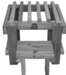
Rain Barrels Iowa $40-55