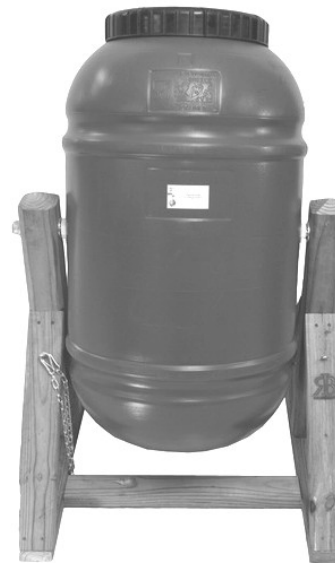
Rain Barrels Iowa $175

The 55-gallon Spinning Composter turns on its stand of pressure-treated lumber to aerate and process compost quickly and naturally.